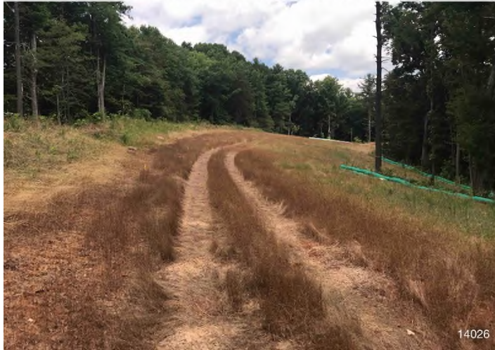
Figure 2: STA 13435+00 – Controls in place and functioning properly.

BRG: 354°N (T) LAT: 37.059603 LON: -79.882106 ±446ft ALT: 1144ft