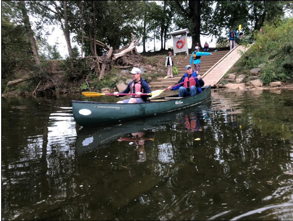
Figure 2. Coastal PDC Team launching canoes on the Rappahannock River