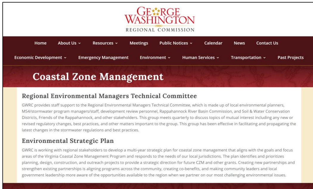
Figure 4. Screenshot of GWRC Coastal Zone Management website

GWRC expanded the “Environment” tab on the website to provide a structure for sub-pages. Coastal Zone Management now has its own page with information on the Regional Environmental Managers Technical Committee and the Environmental Strategic Plan. This page will serve as a location for sharing relevant files. The tab also has a sub-page for Native Plants with information and a link to the Plant Central Rapp Natives website. Other sub-pages include Chesapeake Bay, Green Infrastructure, and Hazard Mitigation.