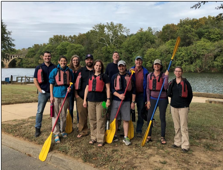
Figure 1. Coastal PDC Team with canoeing equipment

GWRC staff and consultant hosted the Coastal PDC meeting on October 8 including a tour of the CZM funded Cedell Brooks, Jr. Park Native Plants Demonstration Garden and a canoe trip on the Rappahannock River to discuss shoreline erosion.