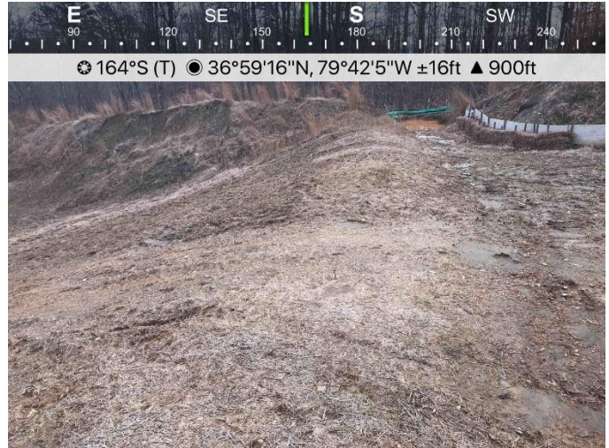
Figure 2: ST14720+20 waterbar requires maintenance