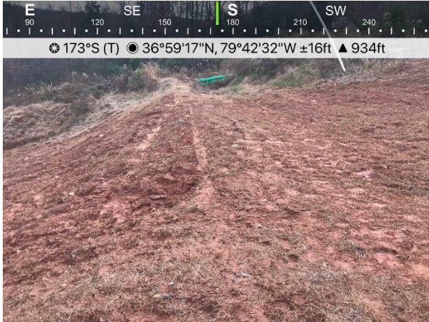
Figure 1: ST14698 waterbar requires maintenance