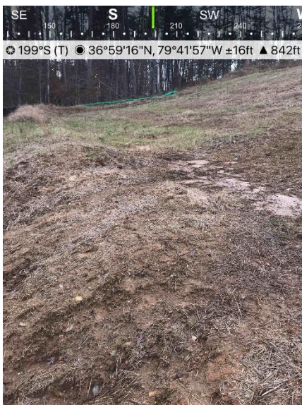
Figure 3: ST14726+95 waterbar requires maintenance