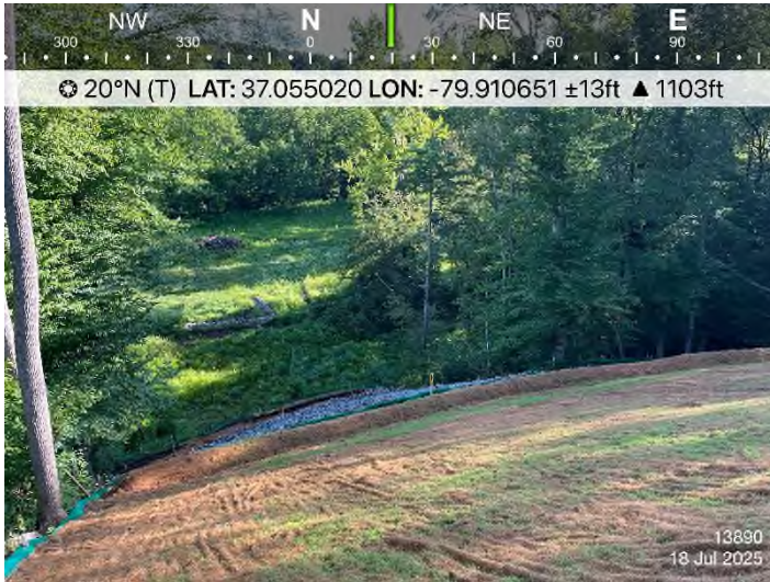
Fig. 1 STA 13890+00: Controls in place and functioning properly.