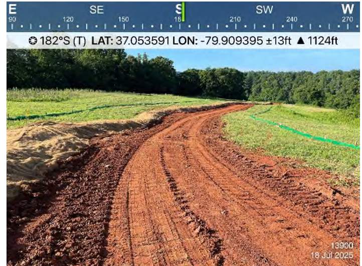
Fig. 2 STA 13900+00: Controls in place and functioning properly.