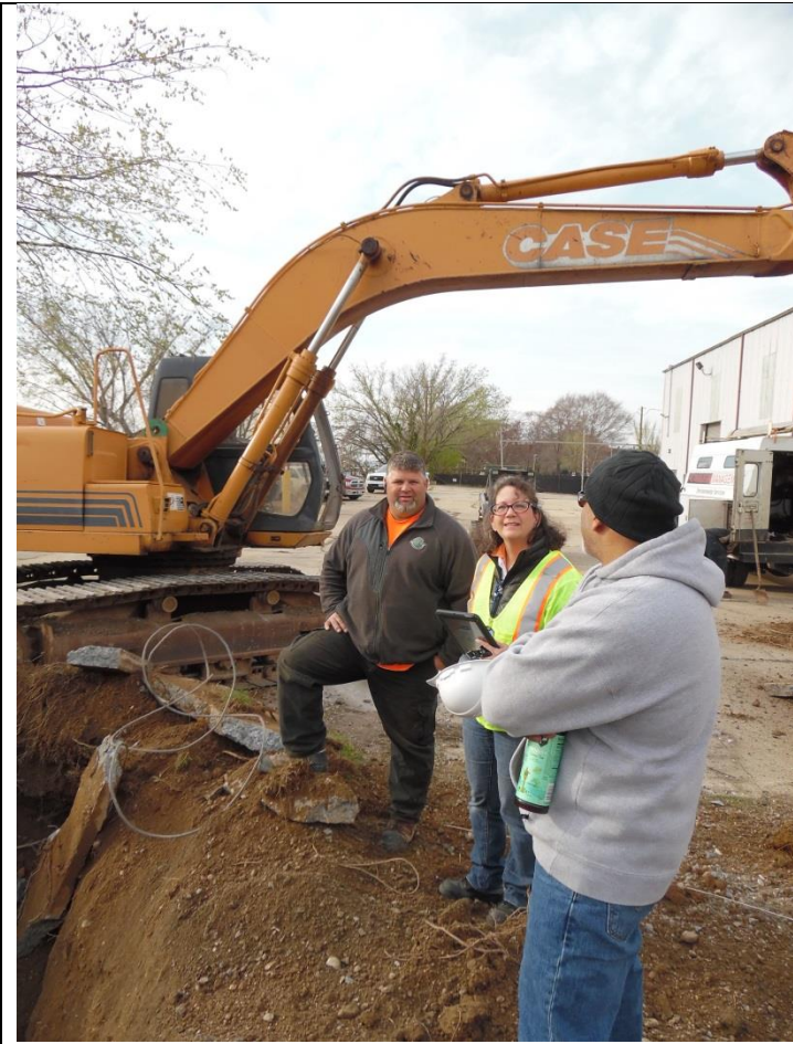
1) Preparing for removal.