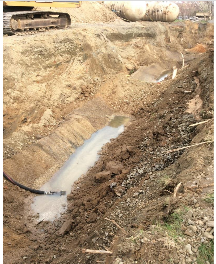
13) Pump out of water in tank trench.