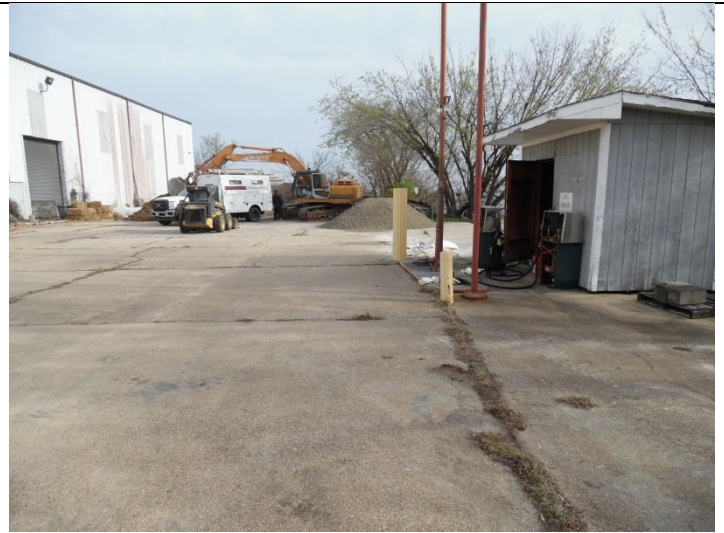
2)View of old dispenser;ocation and tank removal site.