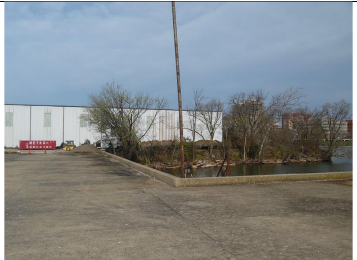
5) View of worksite from dock.