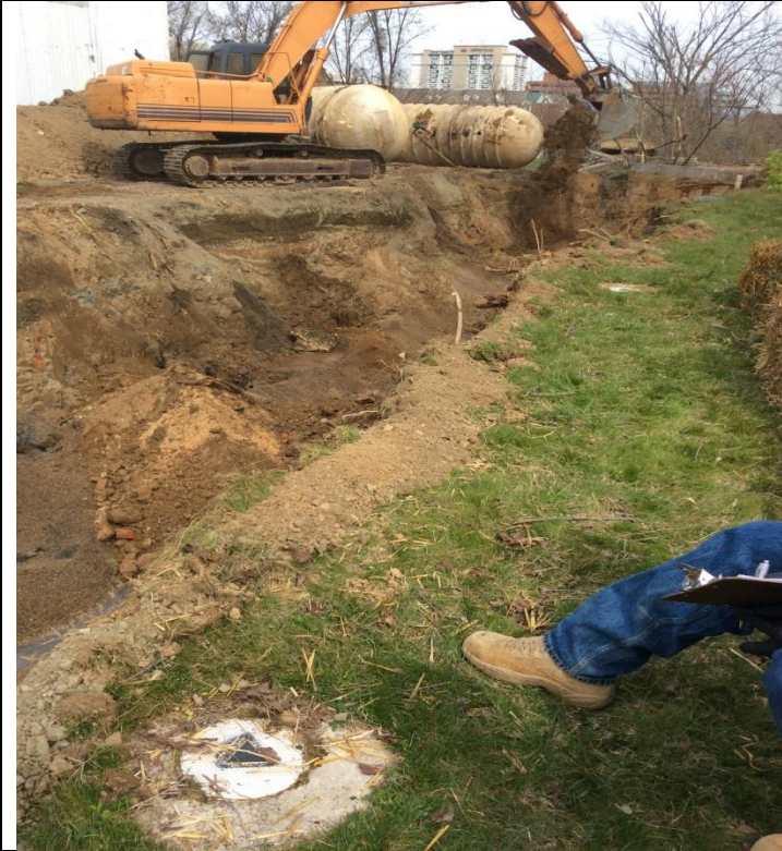
15) Back fill.