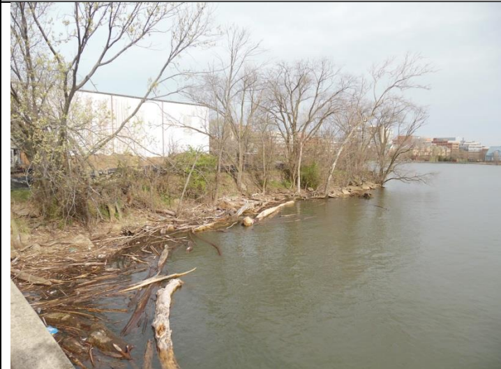
4) View of worksite from dock.