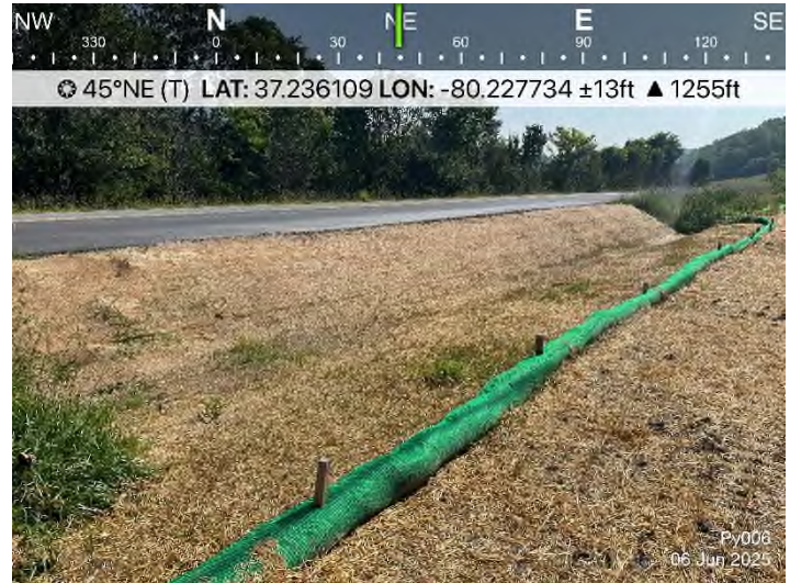
Fig. 2 Pipeyard 006: Controls in place and functioning properly.