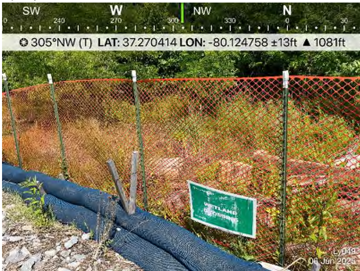
Fig. 3 Laydown Yard 049: Controls in place and functioning properly.