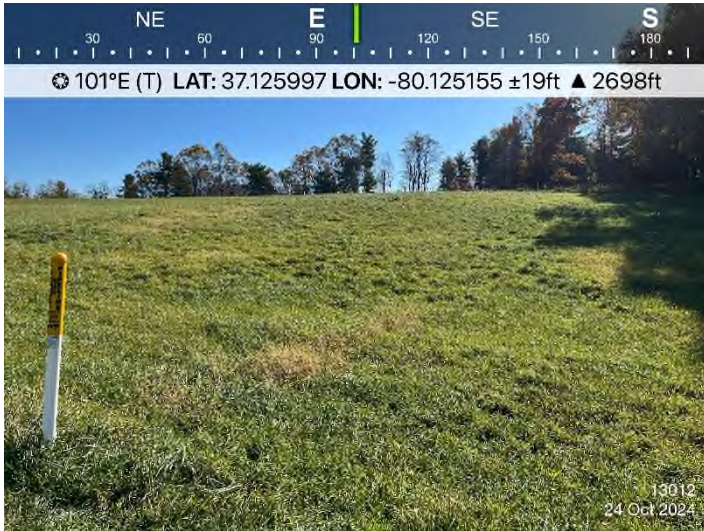
Fig. 1 STA 13012+00: Controls in place and functioning properly.