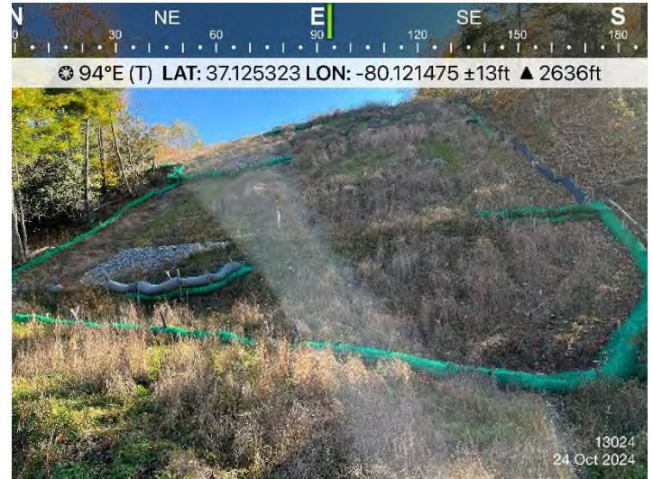
Fig. 2 STA 13024+00: Controls in place and functioning properly.