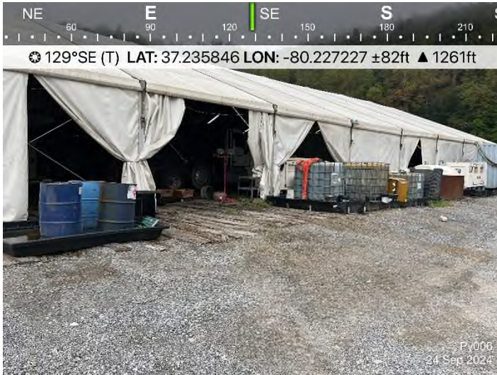
Fig. 1 PY-006: Controls in place and functioning properly.