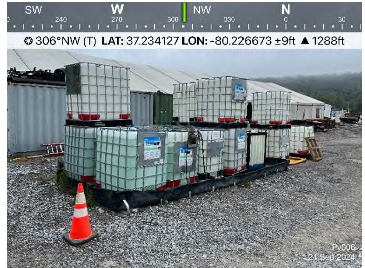
Fig. 2 PY-006: Controls in place and functioning properly.