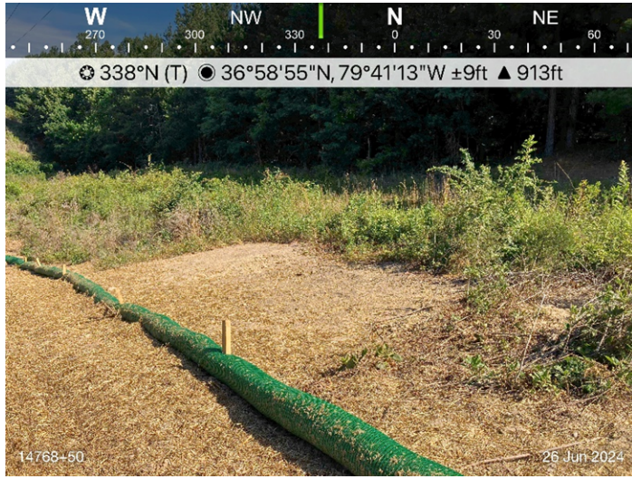
Figure 1: Sta 14768+50, denuded area requires re-stabilization.