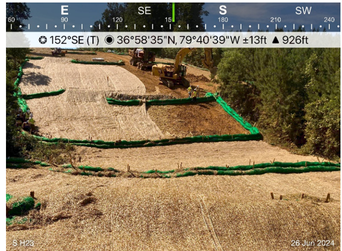
Figure 2: Designated crossing S-H23, final grading and controls are going in.