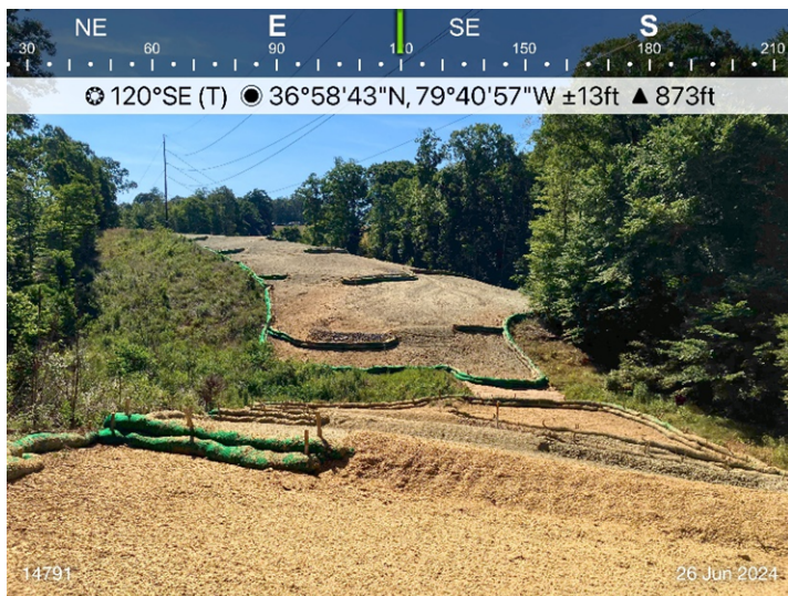
Figure 3: Sta 14791, ESC is in place for active construction.