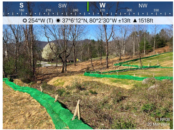
Figure 2: Designated crossing S-RR08, ESC's devices in place.