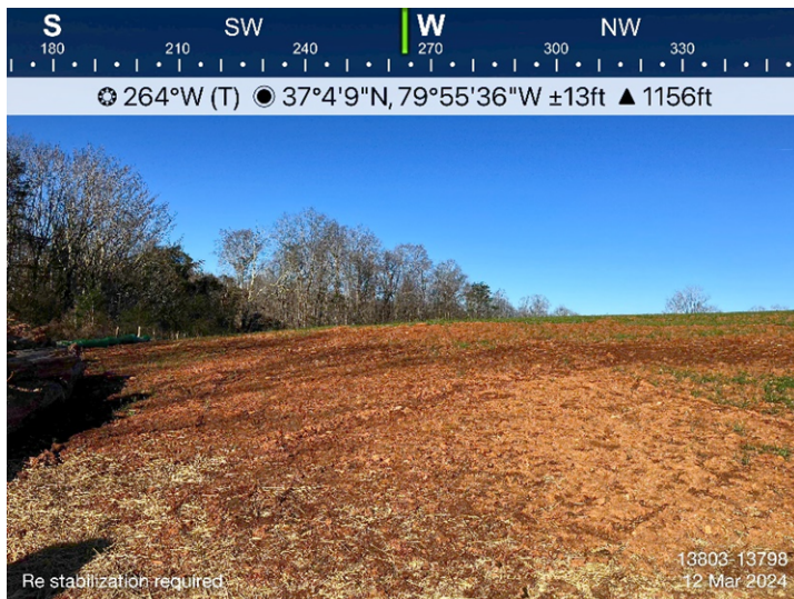
Figure 3: Multiple areas from 13803 to 13798 require re stabilization.