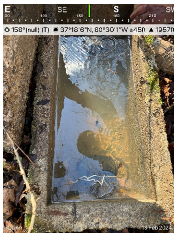
Figure 3: Quinn property prescreen spring box.