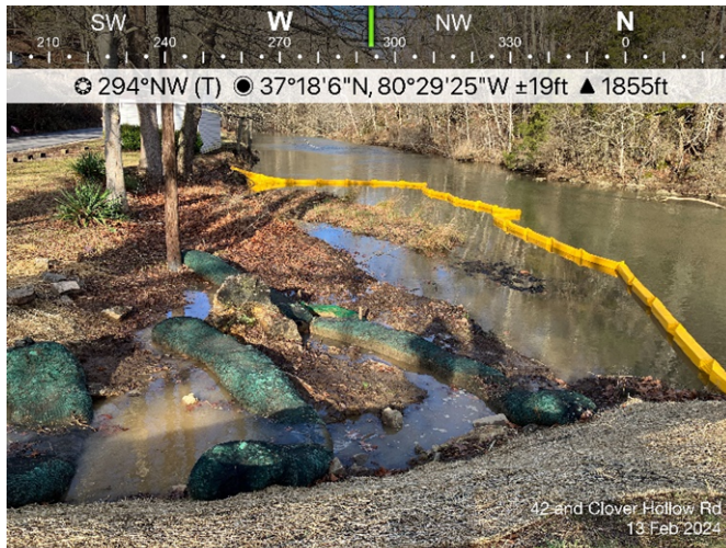
Figure 1: Area near the intersection of 42 and Clover Hollow Rd.