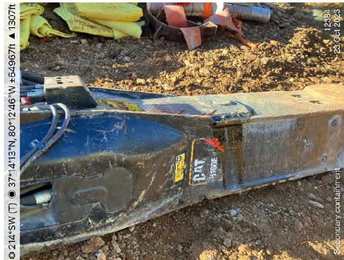
Figure 1: STA 12384+00 – Secondary containment needed.