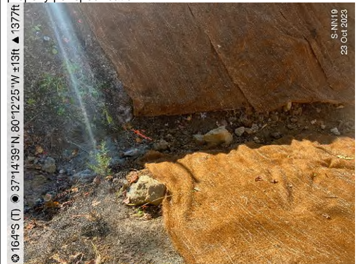
Figure 2: Stream S-NN19 – Erosion matting not keyed in properly per specification.