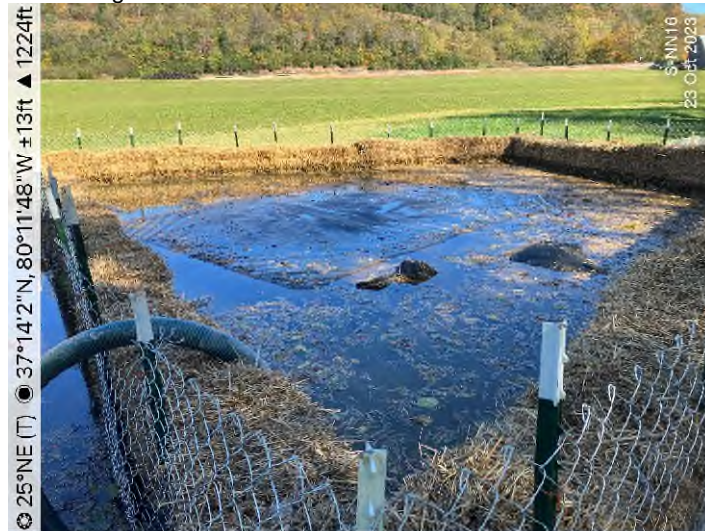
Figure 3: Stream S-NN16 – Controls installed and properly functioning.