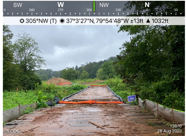
Figure 2: Designated crossing S-CD6, ECD's are in place.