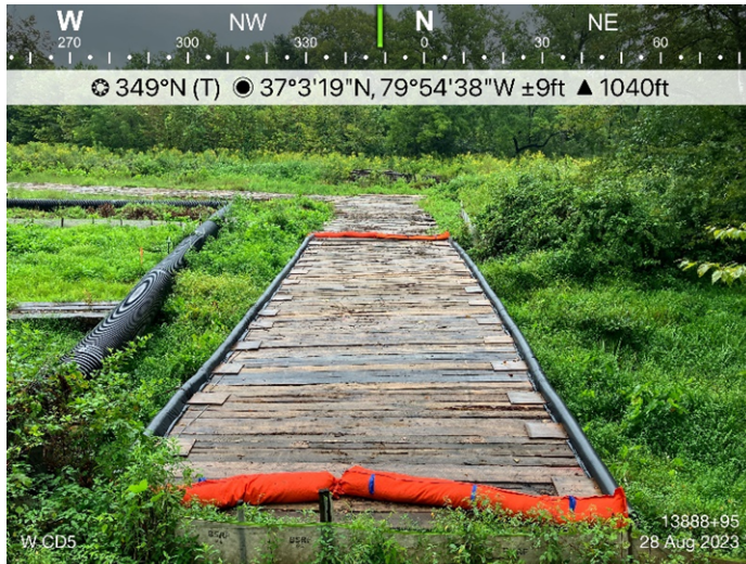
Figure 1: Designated crossing W-CD5, ECD's are in place.