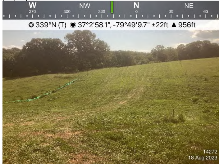
Figure 1: STA 14272+000 – Controls in place and functioning properly.