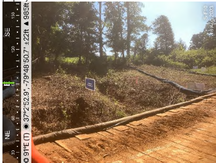
Figure 3: Stream S-F10 – Controls in place and functioning properly.