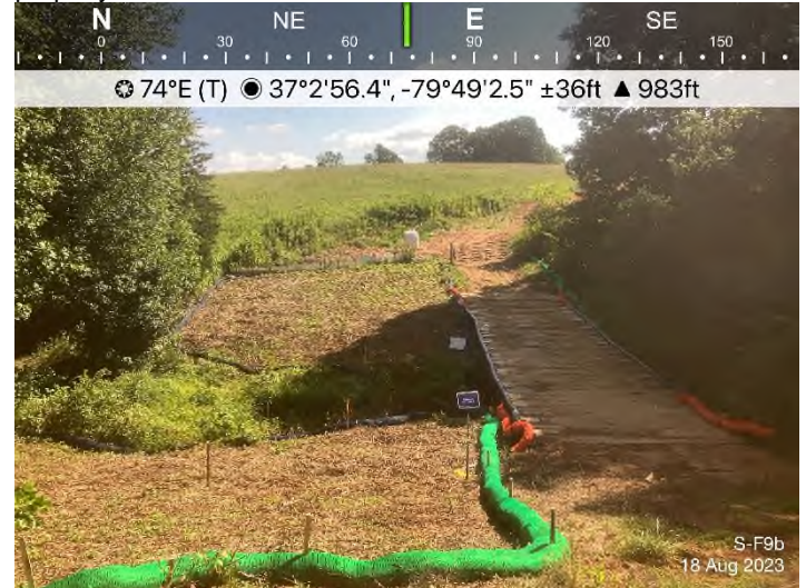
Figure 2: Stream S-F9b – Controls in place and functioning properly.