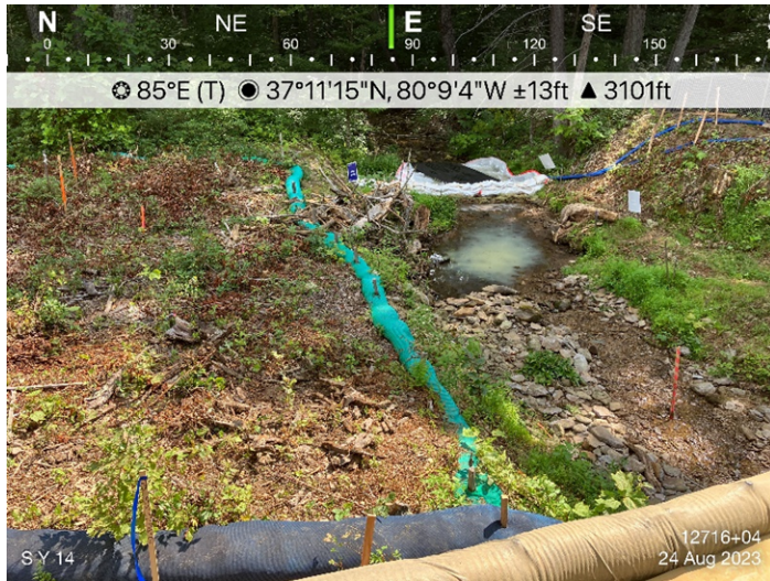
Figure 1: Designated crossing S-Y14, ECD's are in place.