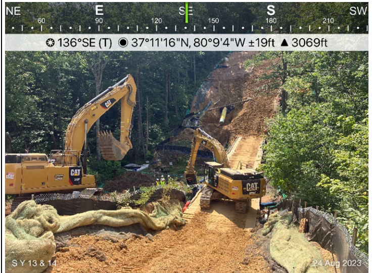
Figure 2: Above designated crossings S-Y13 & S-Y14, ECD's are in place.