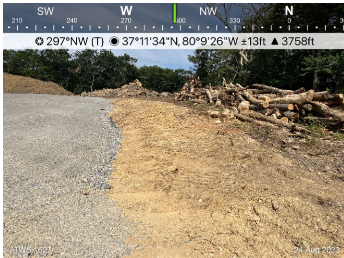
Figure 3: ATWS 1627, denuded area requires stabilization.