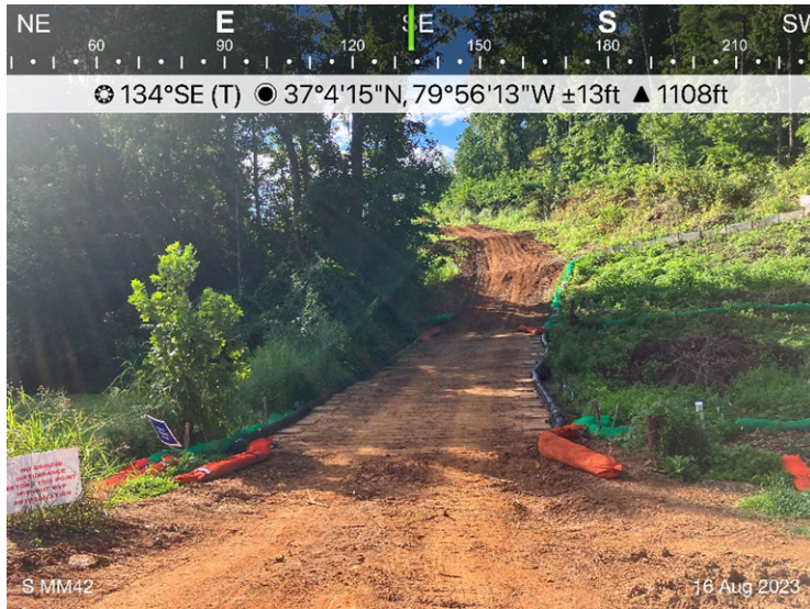
Figure 3: Designated crossing S-MM42, ECD's are in place.