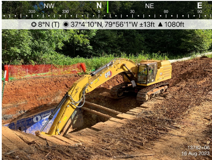
Figure 1: Sta113782+06, S-RR15 designated crossing bore site.