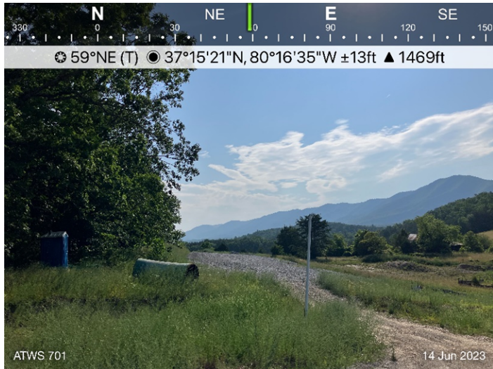
Figure 1: ATWS 701, ECD's are in place.