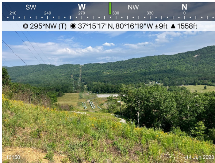
Figure 3: Sta 12150, ECD's and stabilization remains in place.