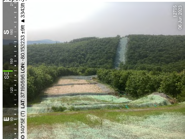
Figure 3: STA 12705+00 – Controls in place and functioning properly.