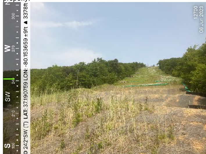
Figure 2: STA 12700+00 – Controls in place and functioning properly.