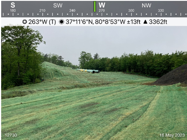
Figure 1: Sta 12730, ESC controls are in place.