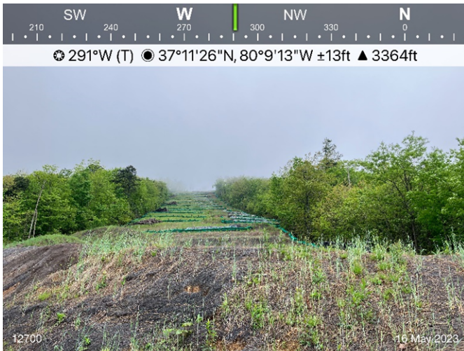
Figure 3: Sta 12700, ECD's and stabilization remains in place.