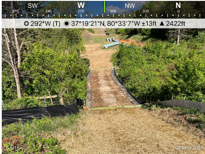
Figure 1: Designated crossing S-IJ18, ECD's are in place.