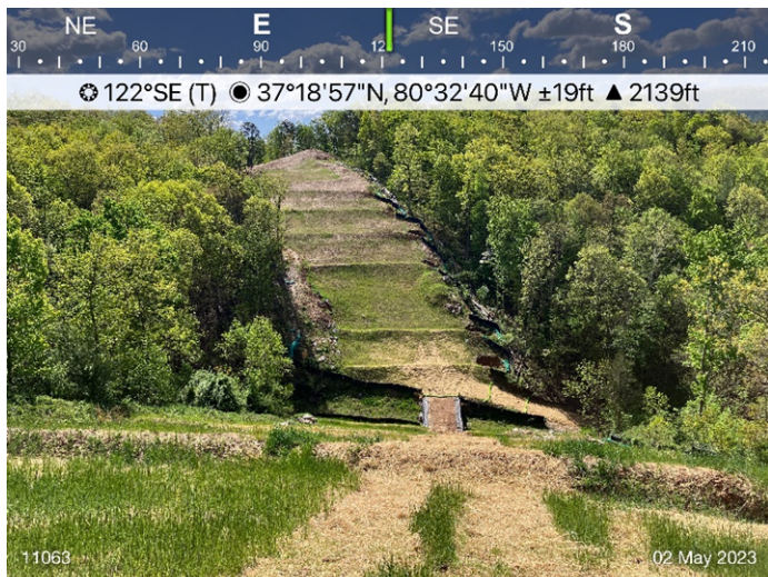
Figure 3: St 11063 ECD's are in place.