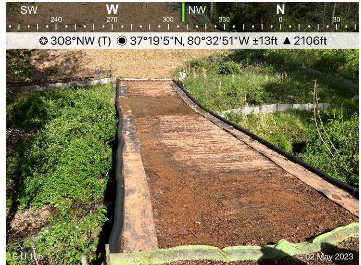
Figure 2: Designated crossing S-IJ16b, ECD's are in place.