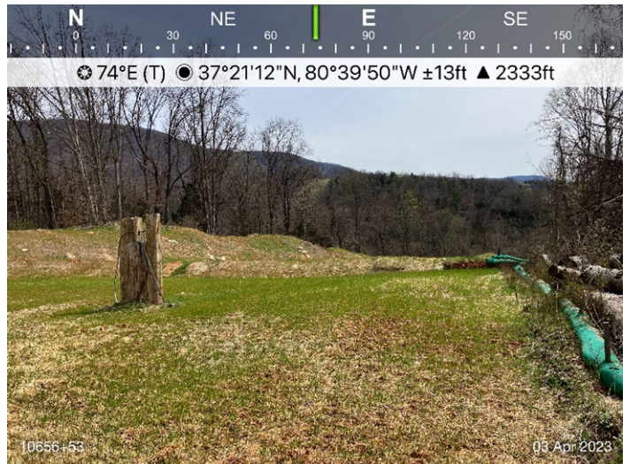
Figure 2: Sta 10656+53, ECD's in place.