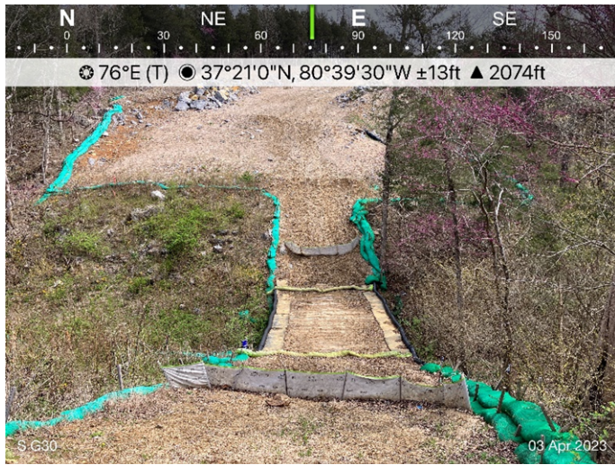
Figure 1: Designated crossing S-G30, ECD's are in place.