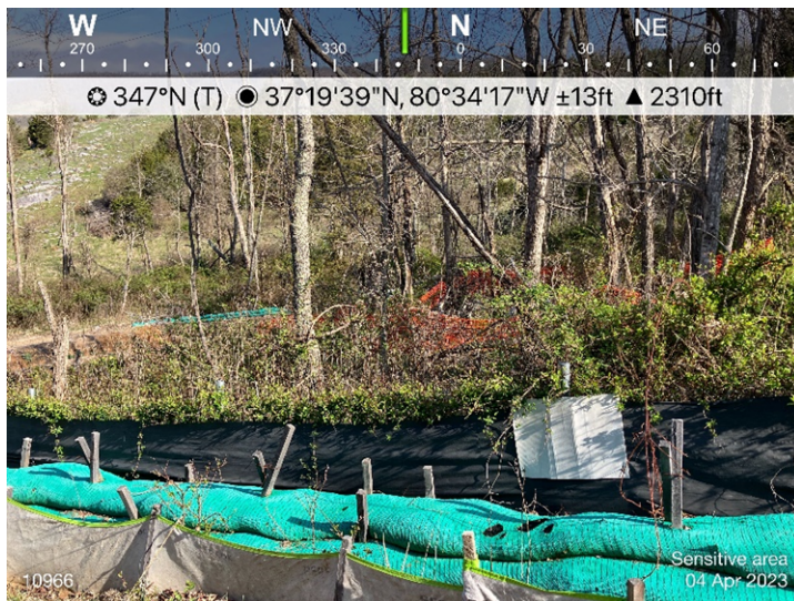
Figure 3: Sta 10966, ECD's in place.