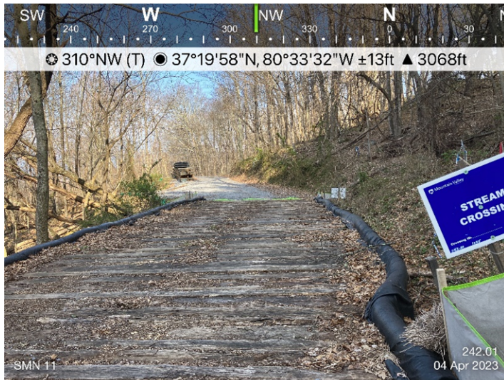
Figure 1: Designated crossing S-MN11, ECD's are in place.