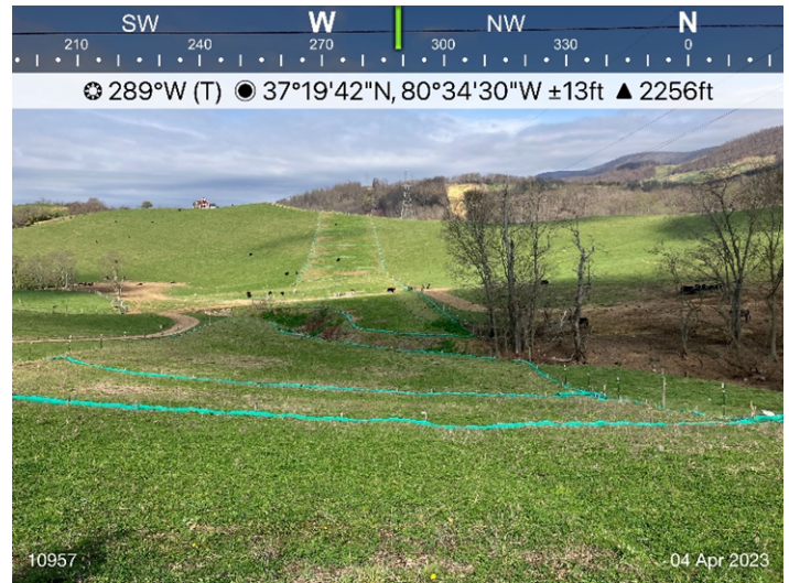
Figure 2: Sta 10957, ECD's in place.