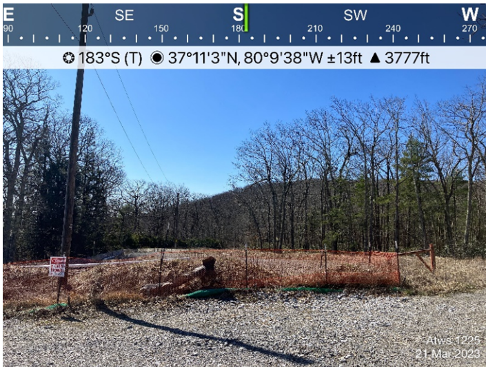
▪ Figure 3: ATWS 1225, ESC in place.