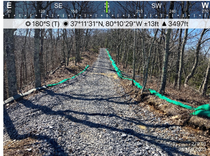
▪ Figure 2: AR RO 279.01, ESC in place.