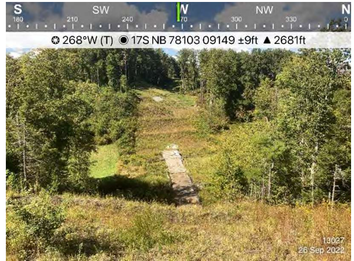
Figure 2: STA 13027+00 – Controls in place and functioning properly.