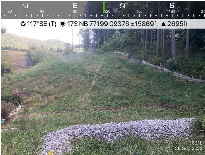
Figure 1: STA 13019+00 – Controls in place and functioning properly.