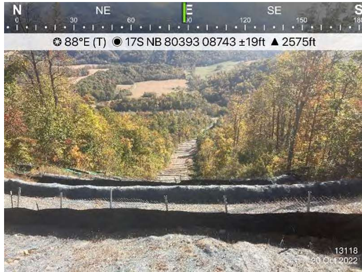
Figure 1: STA 13118+00 – Controls in place and functioning properly.