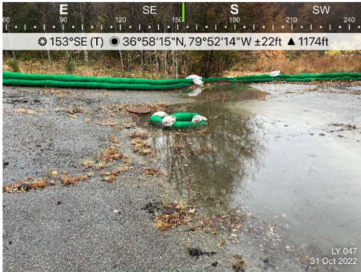
Figure 1: ECD's in place and functioning at LY047.