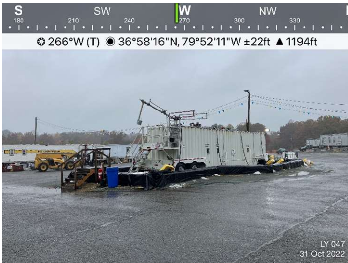
Figure 3: Pollution prevention controls in place and functioning at LY047.