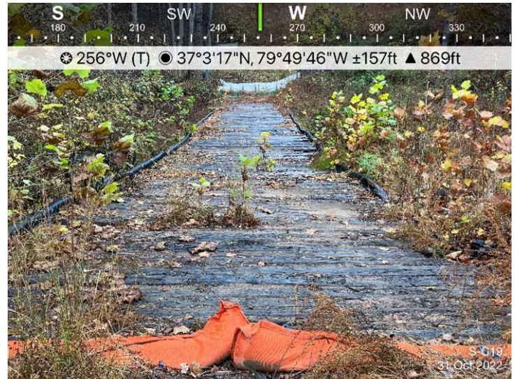
Figure 2: Designated crossing S-C19, ESC controls were in place.