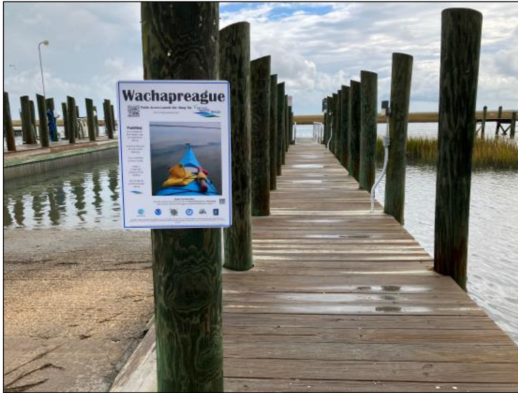
Figure 4. Accreditation sign at Wachapreague Floating Dock, Accomack County