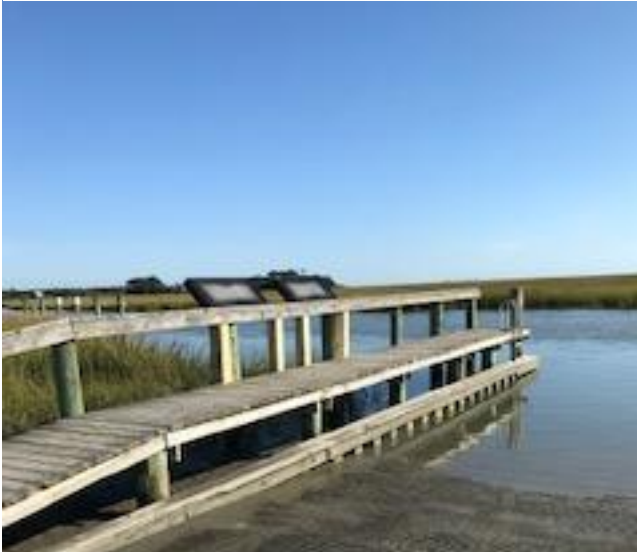
Figure 4: Gargatha Landing