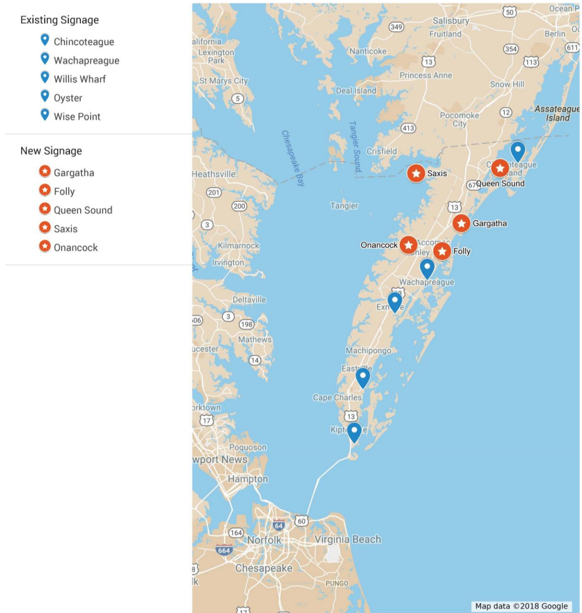
Figure 1: Kiosk Locations Map