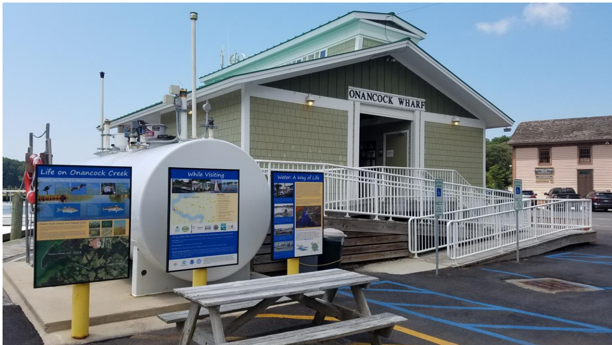
Figure 2: Town of Onancock Interpretive Signage