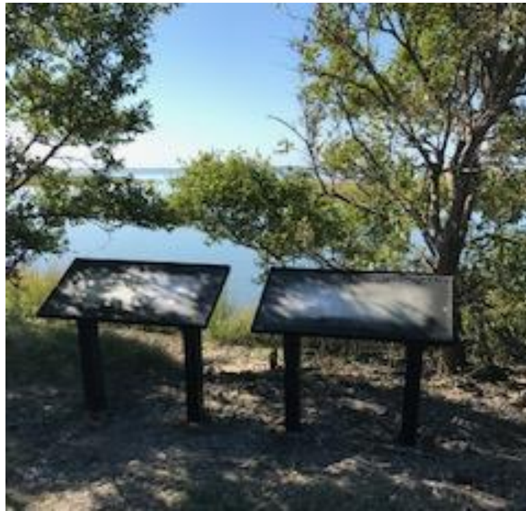
Figure 6: Folly Creek Landing