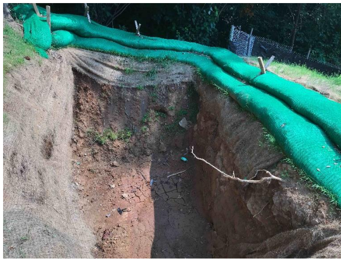
Figure 3: Near St 13135 uncontained trash