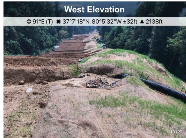
Figure 2: Near St 13120 inlet protection requires maintenance