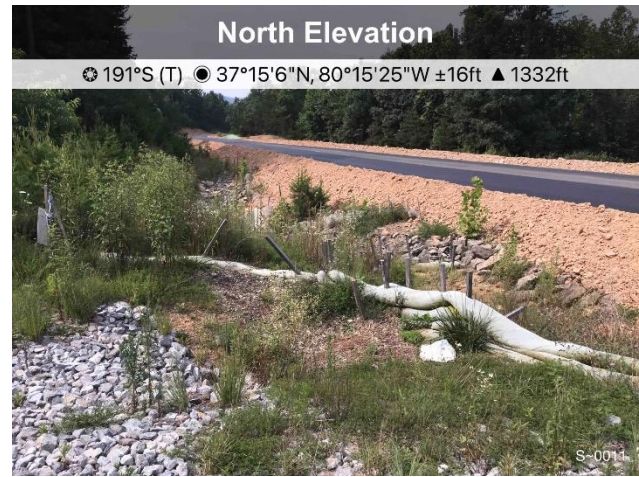
Figure 2: Designated crossing S-0011