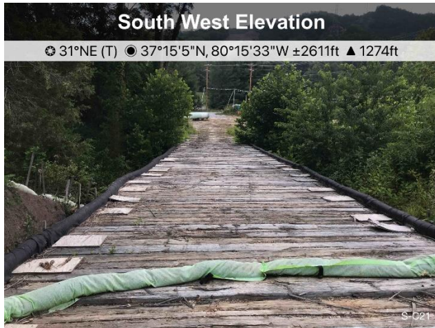
Figure 1: Designated crossing S-C21