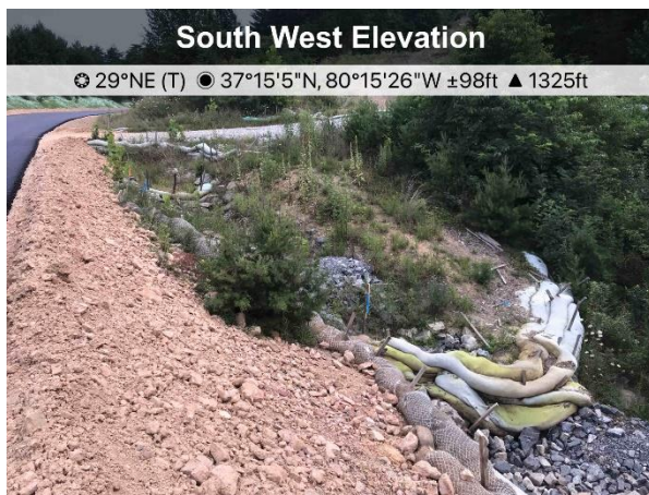
Figure 3: Construction road site not associated with the MVP project, fill slope not stabilized near S-0011.